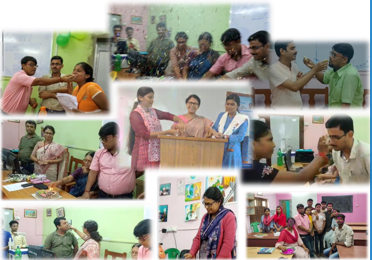
Celebration of birthdays and other programmes by teachers and students

Teacher-Students Relationship: Emotional and cordial relationship between teachers and students is the spirit of our department. Teacher-students relationship is not only bounded in curriculum and syllabus, but also attached with the feelings of each and every student of our department. All the faculty members of Geography department are also cordially committed to each other and also with the students.