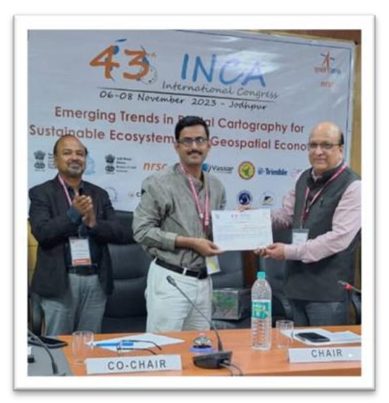
Cerificate of appreciation from INCA,NRSC