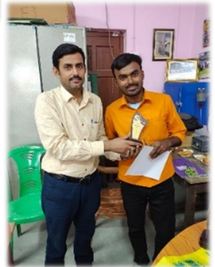
Felicitation to the achievers of the Geography Department by Ex-Principal and other teachers